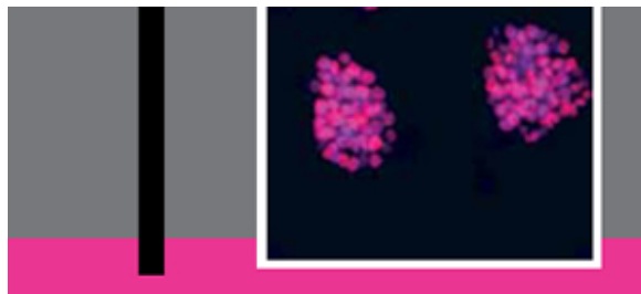
Protein-induced pluripotent stem cell colonies express endogenous nanog (immunostained in red).

For the first time, Sheng Ding of Scripps Research Institute in La Jolla, Calif., and his colleagues induced pluripotency in mouse embryonic fibroblast cells using only proteins, avoiding genetic modification altogether.