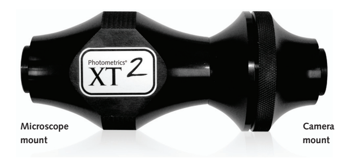
Figure 1. Configuration of the XT2 during shipping.