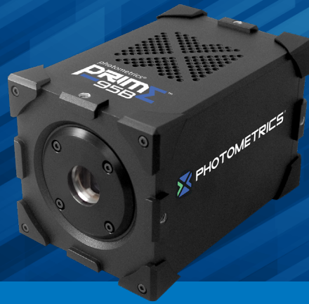
Prime 95B™ Scientific CMOS Camera

TELEDYNE PHOTOMETRICS Everywhereyoulook™