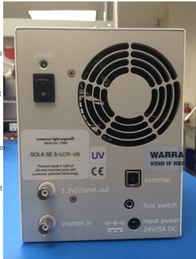
Figure 1. Model and serial number identification label on the SOLA SE 365 light engine rear panel.

Position the unit in an orientation that allows unrestricted access to the DC power connector at the back of the light engine. In an emergency, you may need to disconnect power to the unit quickly. The rocker switch in the top left corner of the rear panel controls electrical power to the unit. A green LED above the switch indicates that power to the light engine is ON. Refer to Figure 1 for the rear panel locations of the input DC power connection, the foot pedal connection and the master electrical power switch. Note that the foot pedal is an on/off toggle switch. Its on/off status cannot be determined from its position. Before connecting the foot pedal, make sure the electrical power switch (Figure 1) is in the OFF position to avoid unintentional initiation of light output. After connecting the foot pedal, and with the light guide output safely directed into an enclosed optical path (e.g. microscope input collimator or a beam dump), turn the power switch ON to begin operation.