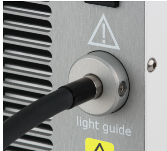
Figure 2. 3 mm diameter liquid light guide inserted in front panel light output port.