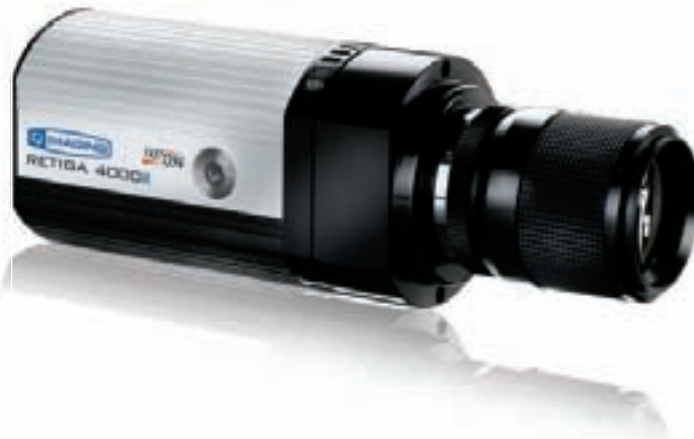
Note: Lens shown for illustration only and is not included.