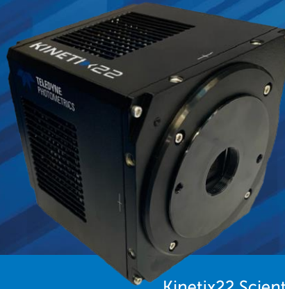
Kinetix22 Scientific CMOS Camera