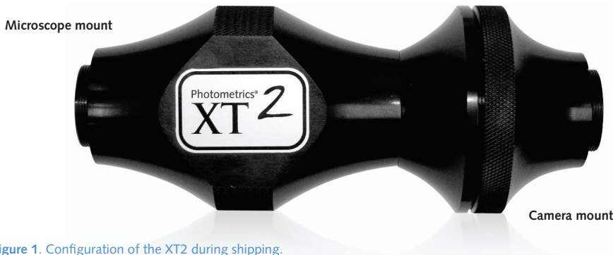
Figure 1. Configuration of the XT2 during shipping.