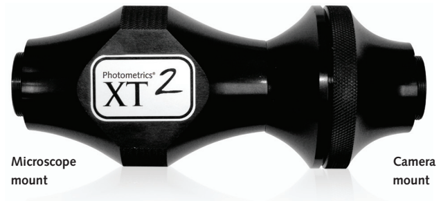
Figure 1. Configuration of the XT2 during shipping.